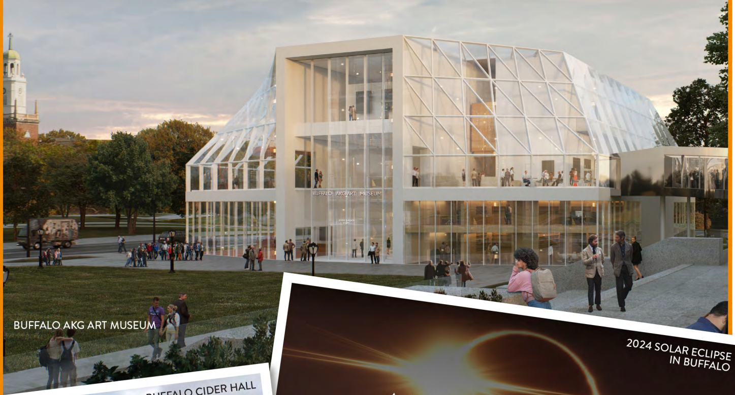
BUFFALO AKG ART MUSEUM