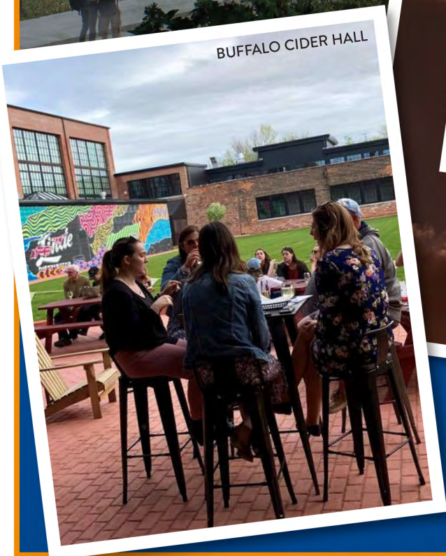
BUFFALO CIDER HALL