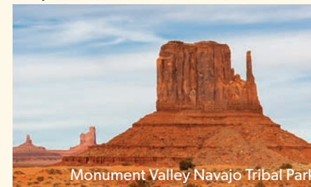
Monument Valley Navajo Tribal Park

Arizona is truly a destination for sight-seeing, exploring the great outdoors and connecting with nature. The 22 national parks and monuments include the Grand Canyon, Saguaro National Park, Petrified Forest, Canyon de Chelly, Organ Pipe and Monument Valley to name a few. The diversity of the landscapes is truly remarkable. Arizona also has spectacular state parks and famous BLM (Bureau of Land Management) like the Wave also known as Coyotes Buttes North. Other remarkable landmarks worth adding to your adventure list are San Xavier Del Bac Mission in Tucson and the London Bridge in Lake Havasu City.