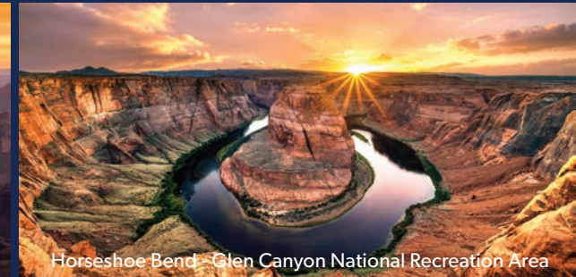
Horseshoe Bend - Glen Canyon National Recreation Area