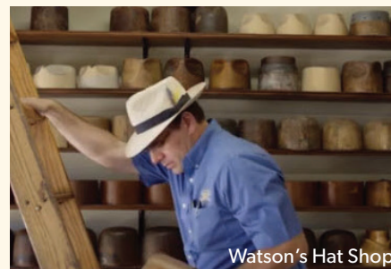
Watson's Hat Shop