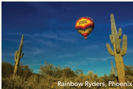
Rainbow Ryders, Phoenix

A private sunset tour over the Phoenix desert via hot air balloon might be the romantic tour of your dreams. Make sure to finish your flight with a glass of bubbly. hotairxpeditions.com or rainbowryders.com