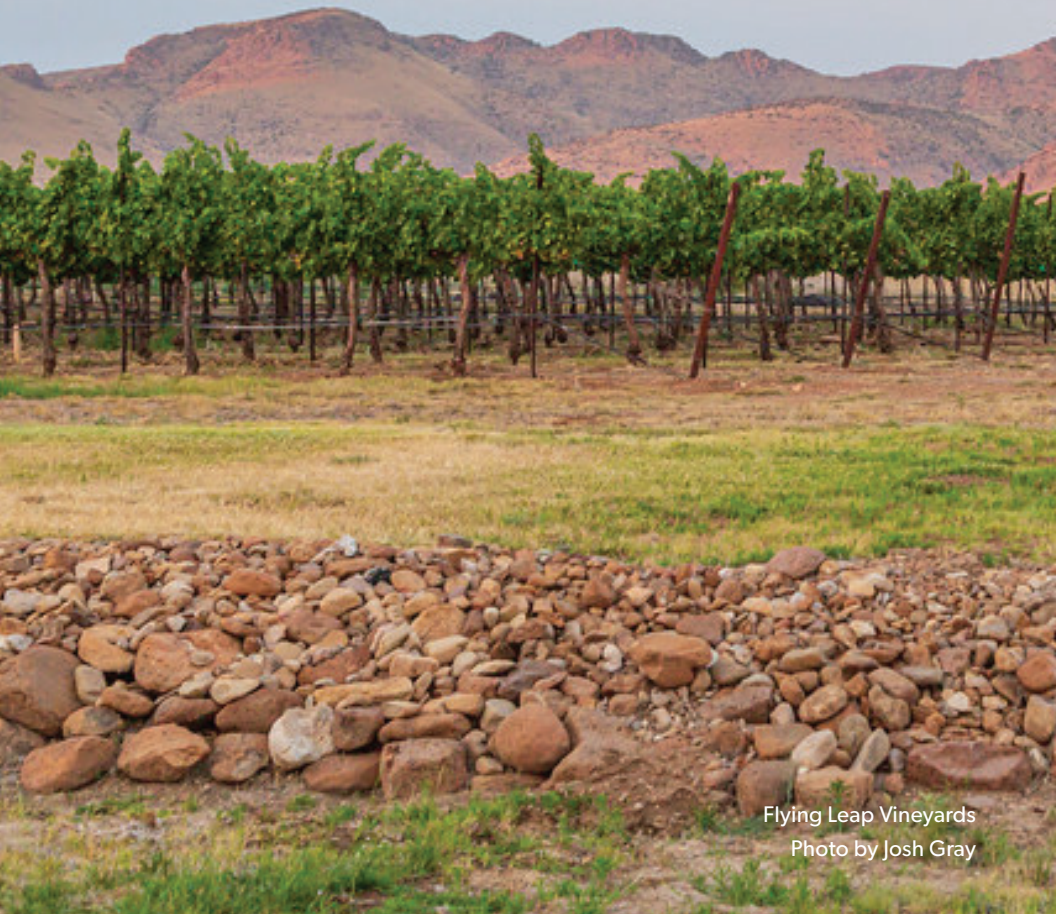
Flying Leap Vineyards