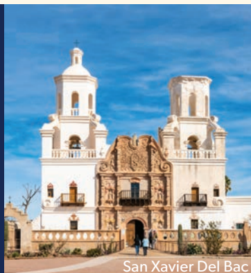
San Xavier Del Bac

Round out your Arizona travel plans with some of our favorite activities, from guided tours around the state with truly exclusive offerings to landmarks, museums and seriously swoon-worthy shopping. These add-on's will make your Arizona getaway a well rounded endeavour to tell your friends about.