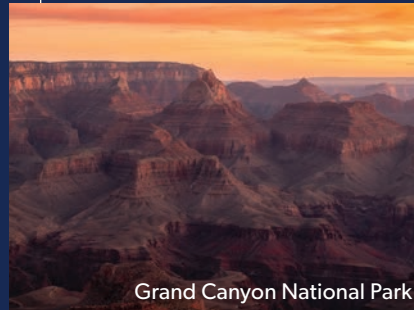
Grand Canyon National Park

When thinking of Arizona, nothing is more iconic than one of America's Crown Jewel National Parks, however, the Grand Canyon is just one option for an unforgettable trip to AZ. The state is home to 21 other national parks and monuments, dozens of beautiful state parks, 22 Tribal Nations, the longest preserved stretch of historic Route 66 and a spirit of service born from southwestern hospitality.