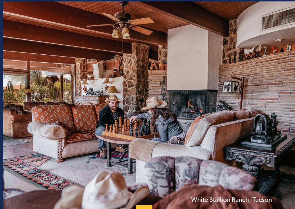
White Stallion Ranch, Tucson