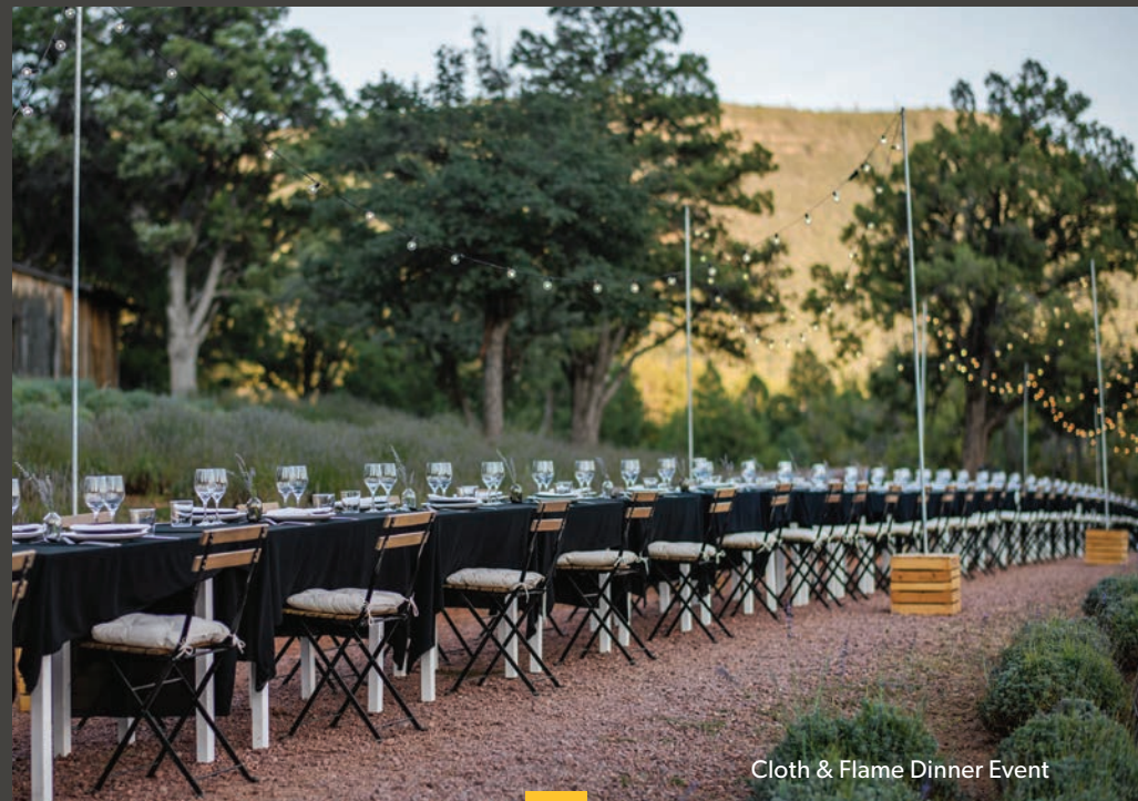
Cloth & Flame Dinner Event

The state has many culinary driven destinations and retreats but when food isn't the only thing driving your itinerary try to make a glamorous pit stop at an exclusive private dining event with Cloth & Flame. Their elaborate table scapes highlight the authentic beauty of the surrounding Arizona landscape whether in the red rocks of Sedona, the ponderosa pines in Flagstaff or the simplistically rustic Sonoran Desert. clothandflame.com