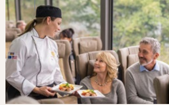
Seat-side meal service