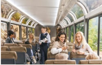
Guest seating with oversized glass-dome views